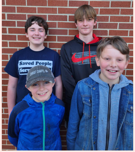
Thank you for giving! Our kids enjoy fun-filled days because of generous folks like you.